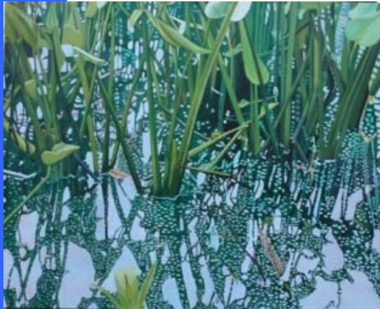
“Water plants in the lake, Brookside” Acrylic on canvas

Yellow Barn Gallery, Stone Tower, Glen Echo Park