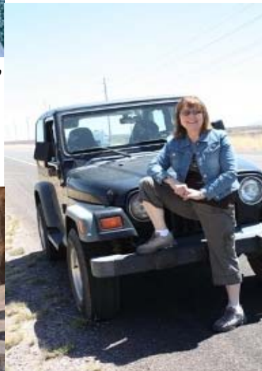
Photo of the artist

Previous Exhibits: Magical Montgomery, Artomatic & Artery 717