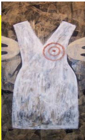
“Angel” Mixed Media